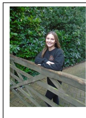
Charlotte Baby Room