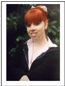
Alice 2-5's Room