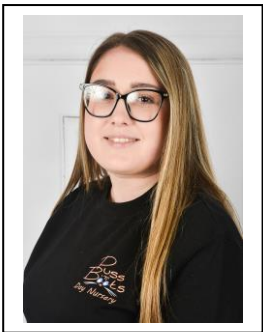
Courtney 2-5's Room