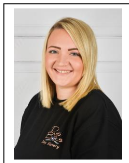
Zoe 2-5's room