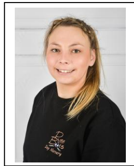
Alice 2-5's room